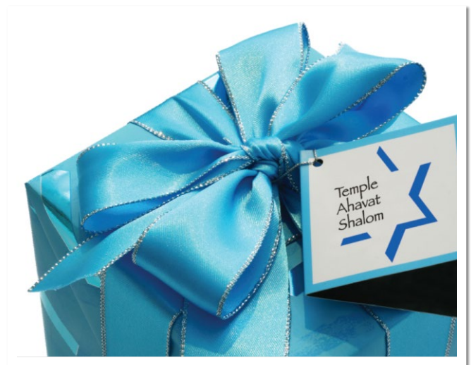
Unwrapping July 1st