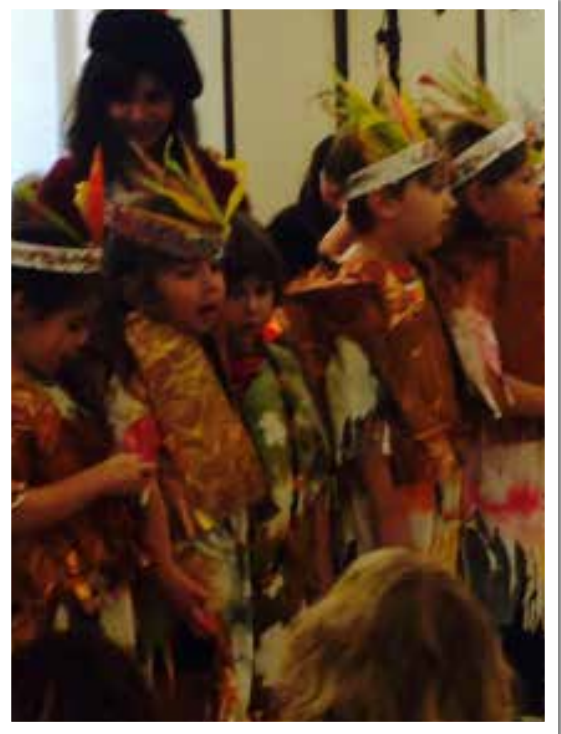
ECEC singing songs of Thanks