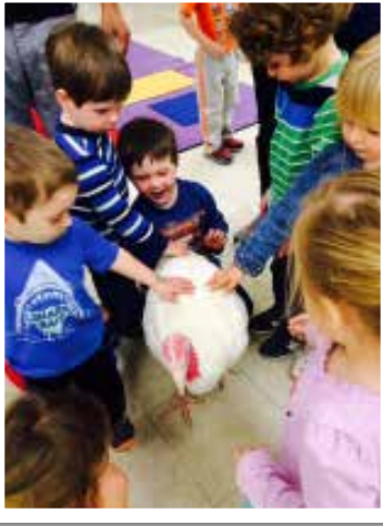
Gobbletta struts her stuff

We are finally able to wear warm sweaters and the weather is definitely getting cooler. Thanksgiving is over and we are now preparing for Hanukkah. The year has flown by and our ECEC children have grown in so many ways. Our families have formed stronger connections and are involved in community activities and the children are settled and happy at school. Our second Rosh Chodesh night for Moms is coming up soon, and the Dads had such a great get-together that they too are