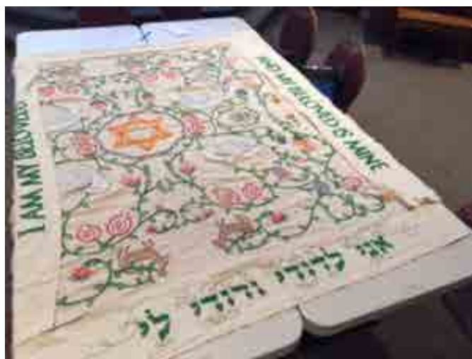
View of chuppah while still undergoing restoration